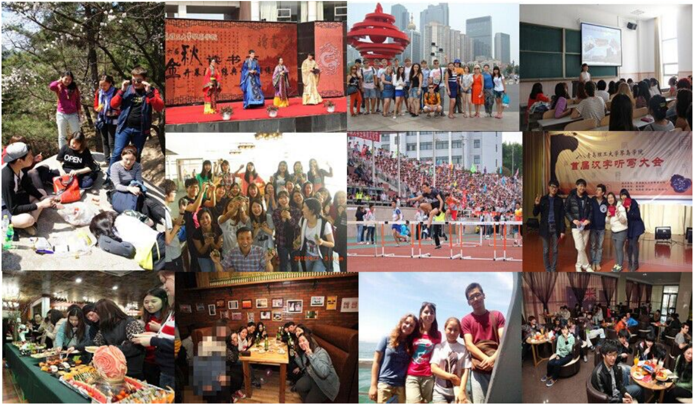
Variety of activities