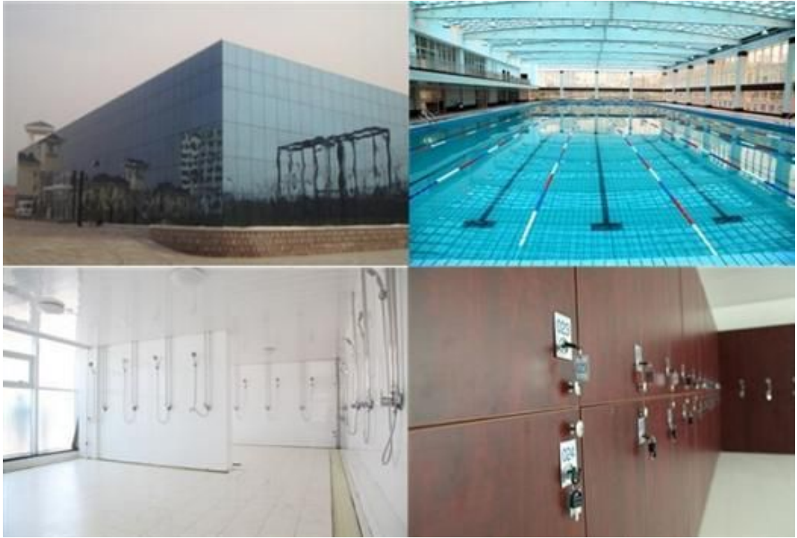
Indoor swimming pool