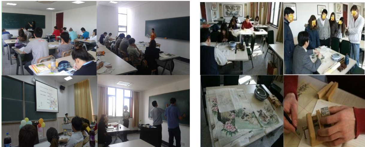
Chinese language class