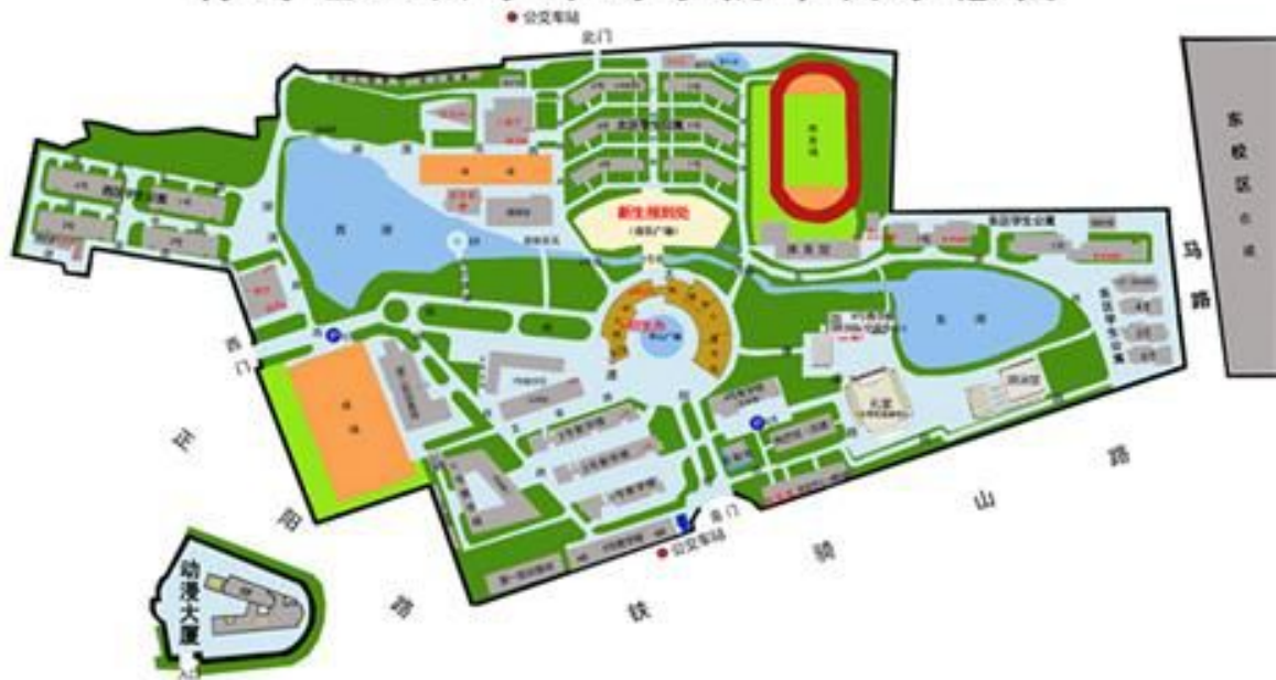
Map of QDC

Address: Qingdao Technological University Qindao College, China