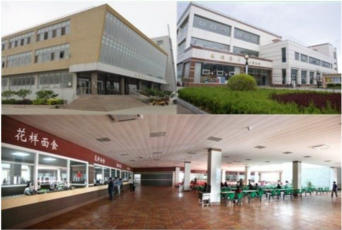
Canteen at campus